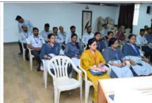
Photograph 5: Day-2 Expert Sessions