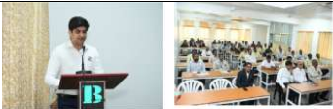
Photograph 3: Inaugural Address by Hon. Karan Shah