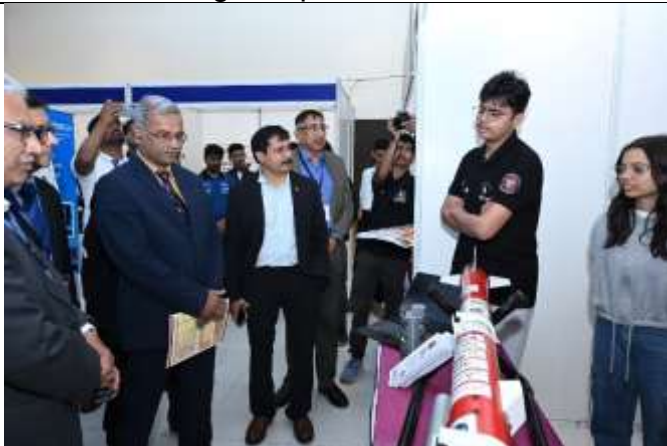
Visit to Exhibitors