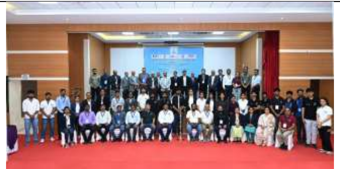
Delegates present for VDP