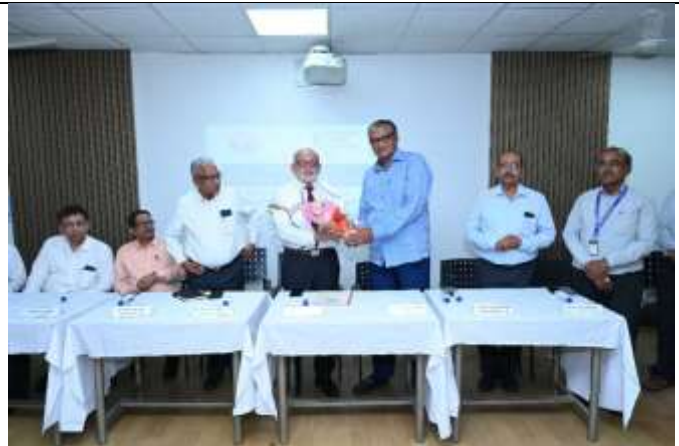
welcome to Chief Guest