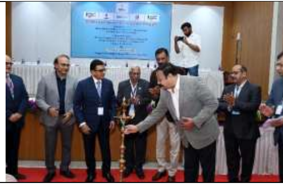
Lighting of lamp