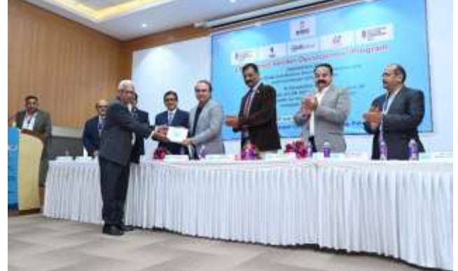
PC chairman Presenting a memento to Guest of Honor