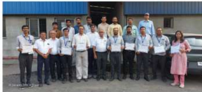
Photograph 7: Certificate Distribution & Group Photo