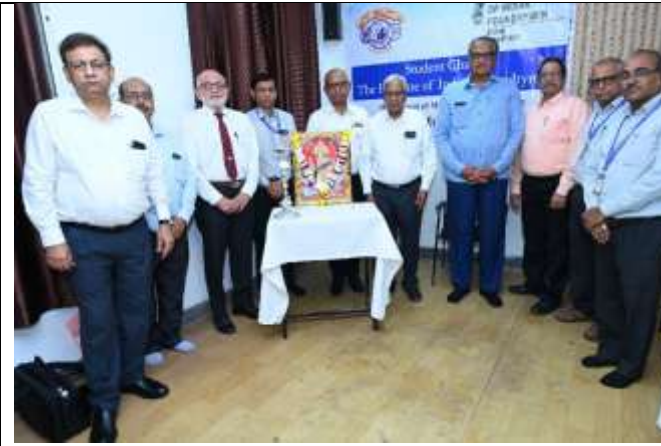
Lighting of lamp