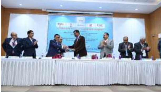
WR chairman welcome to Chief Guest