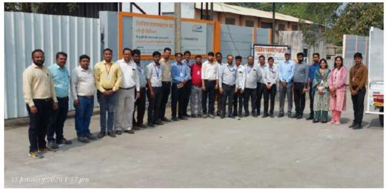
Photograph 6: Glimpses of Industrial Visits