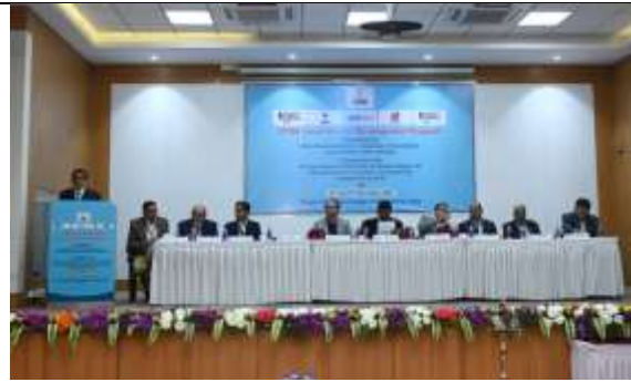
WR chairman - Welcome Speech