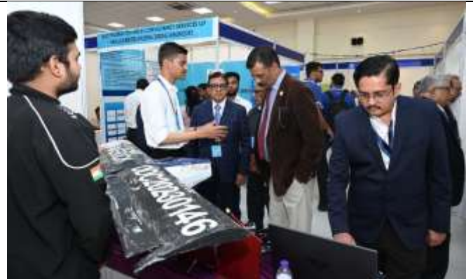
Visit to Exhibitors