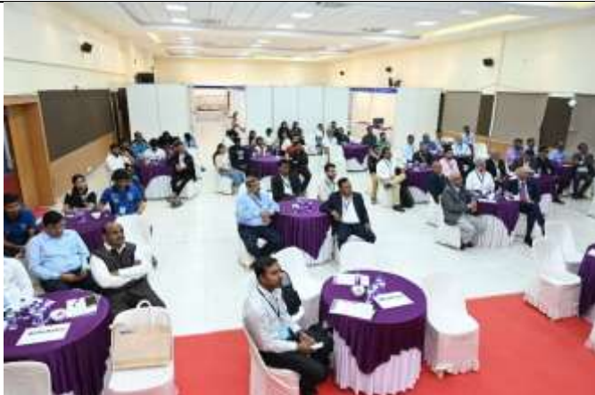
Delegates present for VDP